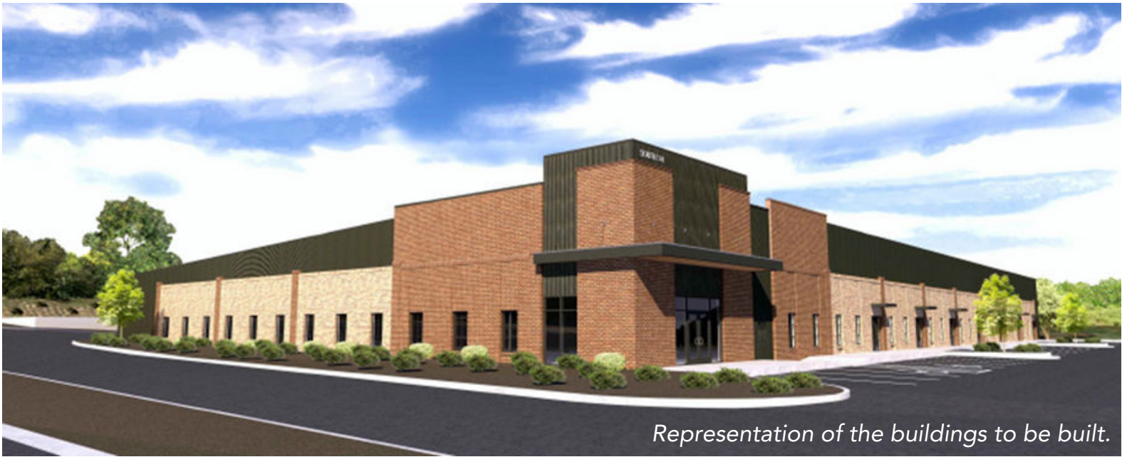
Representation of the buildings to be built.